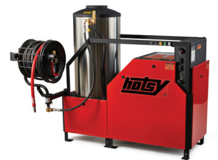
Black Label version comes with hose & hose reel

Upright, vertical coil with 1/2-inch schedule 80 pipe is wrapped with a thick ceramic fiber insulation, delivering high efficiency and maintains constant temperature using Natural Gas or LP Gas